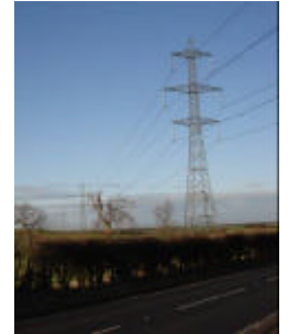
Taken from Hilton to Seamer Road

The turbines will be at least TWICE THE HEIGHT of the existing electricity pylons and of the Transporter Bridge!